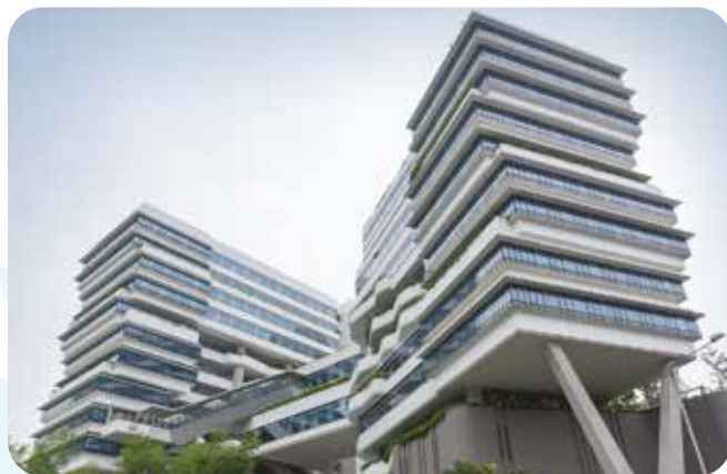
Chai Wan THEi campus, a new purpose-built campus is now in operation. The attractive twin-tower building design provides a dynamic and engaging learning environment for students.

香港高等教育科技學院(THEi)屬下的環境及設計學院、工商及酒店旅遊管理學院，以及科技學院，提供以專業、多元、實務為本的學士學位課程及學士學位銜接課程，為中六及高級文憑畢業生提供升學出路。作為VTC院校成員，THEi的課程揉合理論與實務知識，著重實習，並透過專題研習及海外交流，培育具備專業才幹的畢業生。